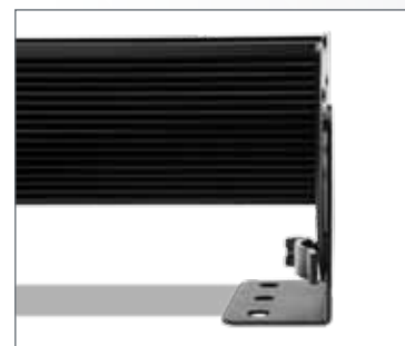
Hidden quick release fixings and flat end plates