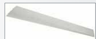
Cyc and border light lens