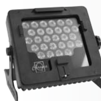
City Theatrical accessories holder