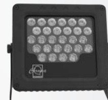
Clear glass lens