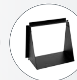
Half top hat