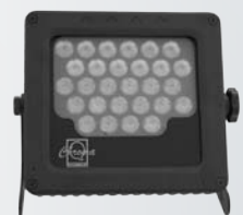
Frosted glass lens

For the latest news and information on the Chroma-Q range, visit www.chroma-q.com