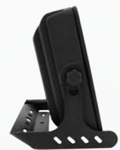
CF Compact side profile